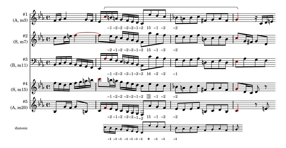
Fig. 4. The 5 complete occurrences of the first counter-subject into Fugue #2 in C minor (BWV 847). (Note that this counter-subject actually has a latter occurrence, split between two voices.) In these occurrences, all notes – except the first and the last ones – have exactly the same length. The values in the occurrences indicate the intervals, in number of semitones, inside the counter-subject. Only occurrences #2 and #5 have exactly the same intervals. The occurrence #4 is almost identical to occurrence #1, except that it lacks the octave jump (+3 instead of +15). Between groups {#1, #4}, {#2, #5}, and {#3}, the intervals are not exactly the same. However, all these intervals (except the lack of the octave jump in #4) are equal when one considers only diatonic information (bottom small staff): clef, key and alterations are here deliberately omitted, as semitone information is not considered.

in the first book of Bach's Well-Tempered Clavier , we notice that g is always between -8 and +6, and, in the majority of cases, between -4 and +1.