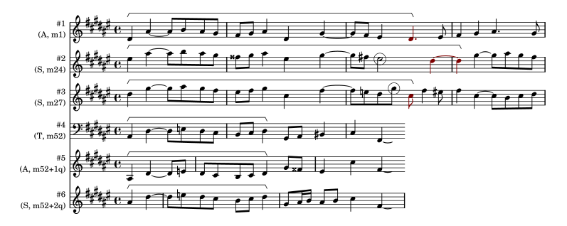
Fig. 6. Some subject occurrences in Fugue #8 in D# minor. The occurrence #1 is the first one, and is similar to 16 occurrences, sometimes with diatonic transpositions. In the occurrence #2, the last but one note of the subject (circled E) has not the same length than in the other occurrences (and this is forbidden by our substitution function \delta ). In the occurrence #3, a supplementary note (circled G) is inserted before the end of the subject, again preventing the detection if the true length of the subject is considered. Moreover, the occurrences #3, #4 and #5 are truncated to the head of the subject, and lead to a false detection of subject length.